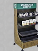
Custom Point-of-Sale Displays