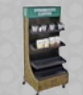
Custom Point-of-Sale Displays