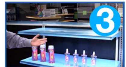
Light comes on without rewiring