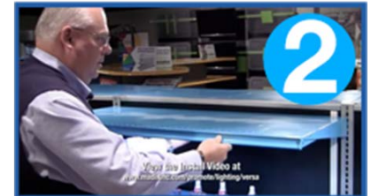
Insert shelf in new location