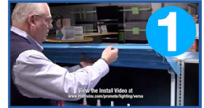
Lift shelf to reposition