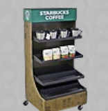
Custom Point-of-Sale Displays