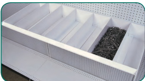
Nail Bin Shelf.