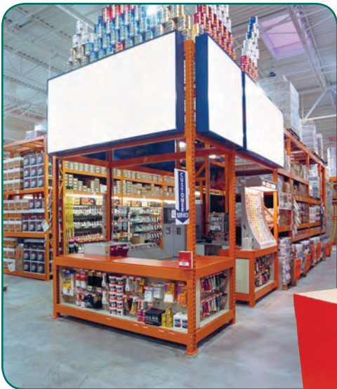
Omega used as a paint mix station.

Service is what makes Madix stand out from the competition. You will find excellent service in all aspects of our business, from the sales force, customer service, store planning, accounting and installation personnel.