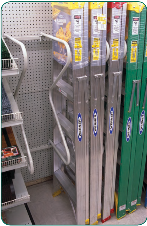
"M" Vertical Divider Arm used with Vertical Divider Bar to separate product.