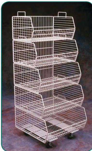
Universal Basket, stackable with casters.