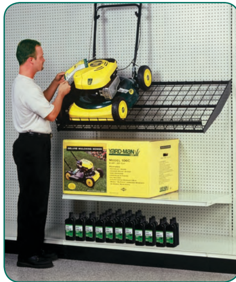
Wire Grid Lawn Mower Shelf.

Madix's goal is to partner with retailers and brand manufacturers, influencing every product in the store, solving merchandising and operations challenges.